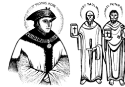
English Martyrs and Ss Peter & Paul's