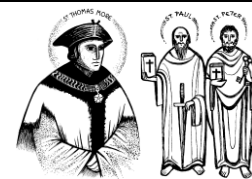
English Martyrs and Ss Peter & Paul's