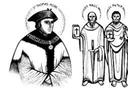
English Martyrs and Ss. Peter and Paul's