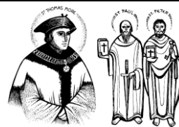
English Martyrs and Ss. Peter and Paul's