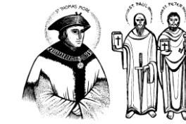
English Martyrs and Ss. Peter and Paul's