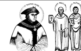
English Martyrs and Ss. Peter and Paul's