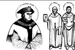
English Martyrs and Ss. Peter and Paul's