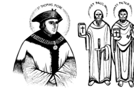
English Martyrs and Ss. Peter and Paul's