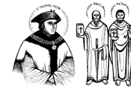
English Martyrs and Ss. Peter and Paul's