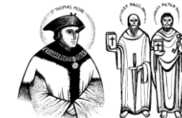
English Martyrs and Ss. Peter and Paul's