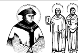
English Martyrs and Ss. Peter and Paul's