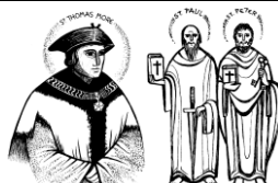
English Martyrs and Ss. Peter and Paul's