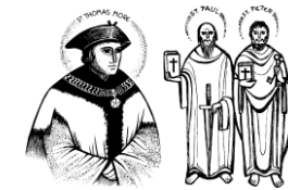
English Martyrs and Ss. Peter and Paul's