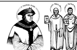
English Martyrs and Ss. Peter and Paul's