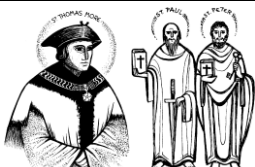
English Martyrs and Ss. Peter and Paul's